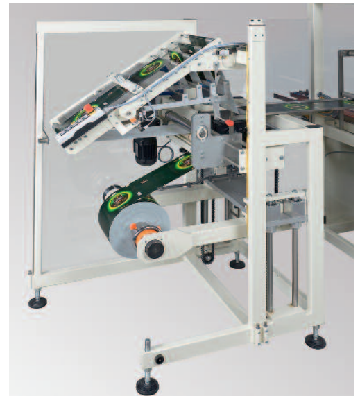
Roll stand, which can be positioned either in line with or transversely to the conveying direction.